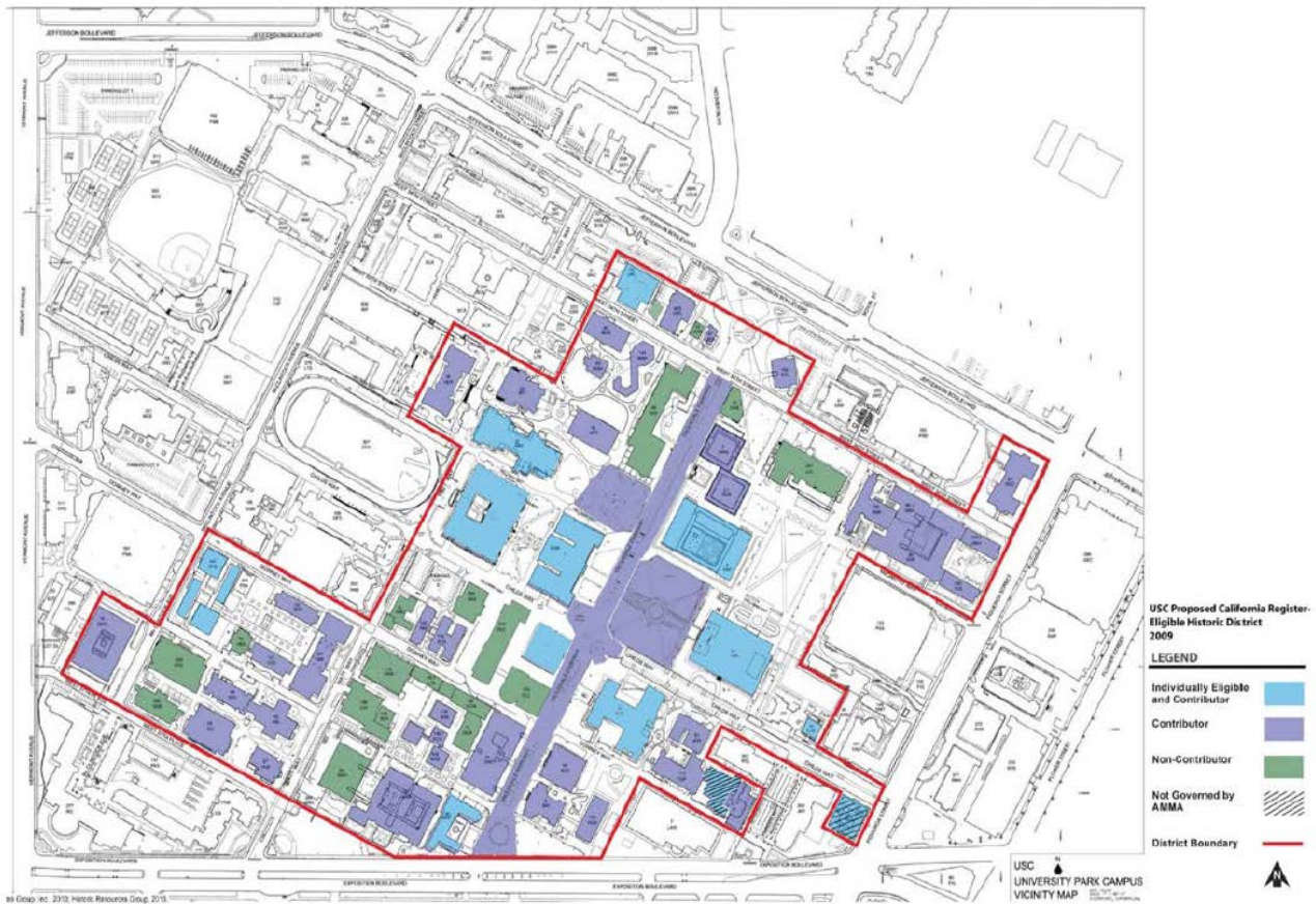
FIGURE 7. MAP OF POTENTIAL HISTORIC DISTRICT (AMMA FIGURE 2)

B. Minor Construction to Existing Building. Prior to the issuance of a building permit for any minor change or alteration, including but not limited to routine maintenance, minor system upgrade, change to secondary spaces (e.g. restrooms or storage spaces), or change to spaces that as an existing condition contain no character-defining features to properties that are Potential Historic District contributors, individually significant resources, or both, the applicant shall produce the following in consultation with the Los Angeles Office of Historic Resources (OHR):