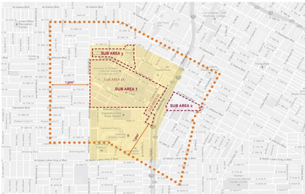
FIGURE 6. AREA FOR FUTURE PARKING LOCATIONS.

F. Parking Space Design. Notwithstanding any provision in the LAMC to the contrary, up to a one-foot by one-foot column intrusion may be permitted into one inside corner (opposite the drive aisle) of a standard parking stall, as shown below. All other provisions of the LAMC relating to the design of parking spaces shall be applicable to a Project within the Specific Plan area.