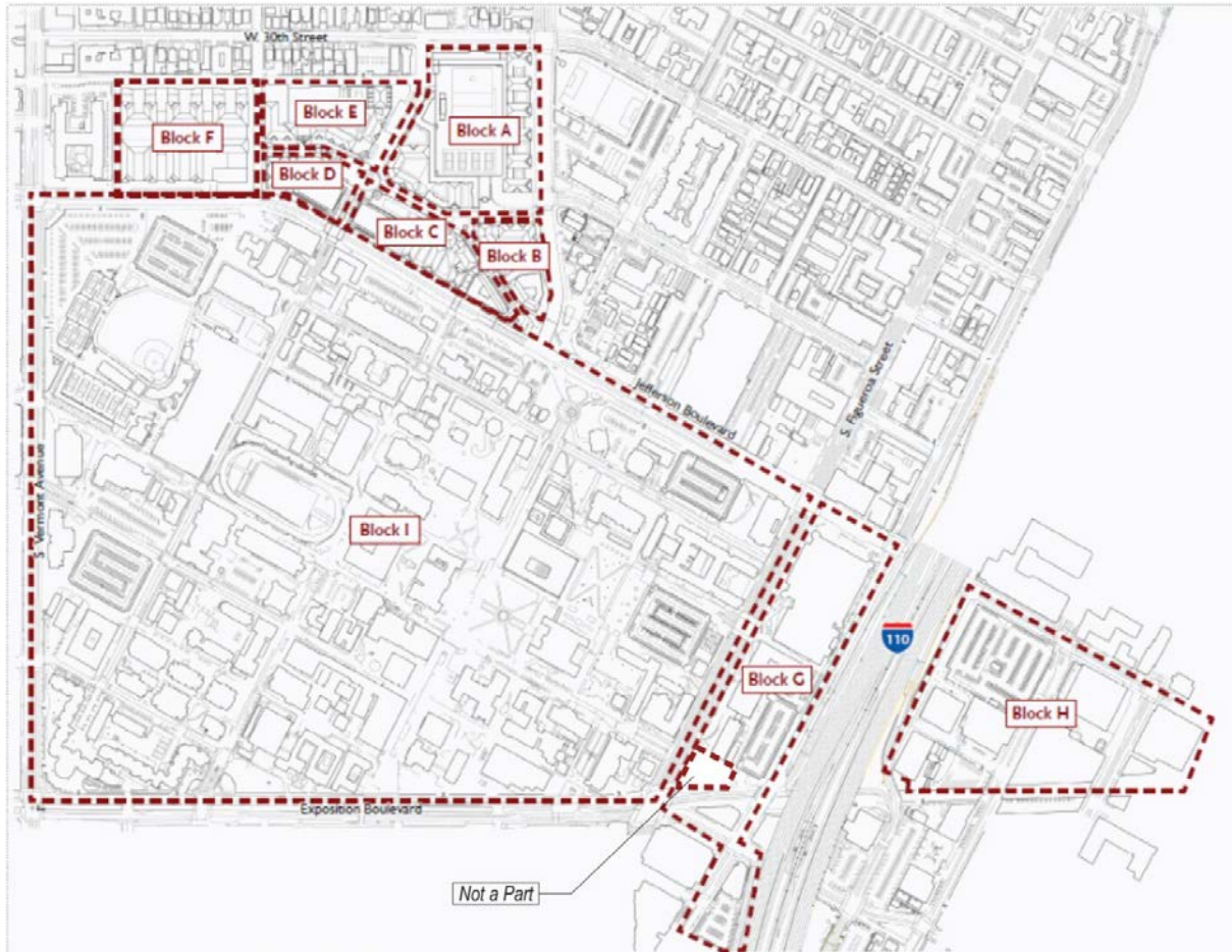
FIGURE 3. URBAN DESIGN BLOCKS

D. Pedestrian Linkage Requirements in Subarea 3. The Planning Department shall review and make a determination as to whether development plans comply with the following requirements: