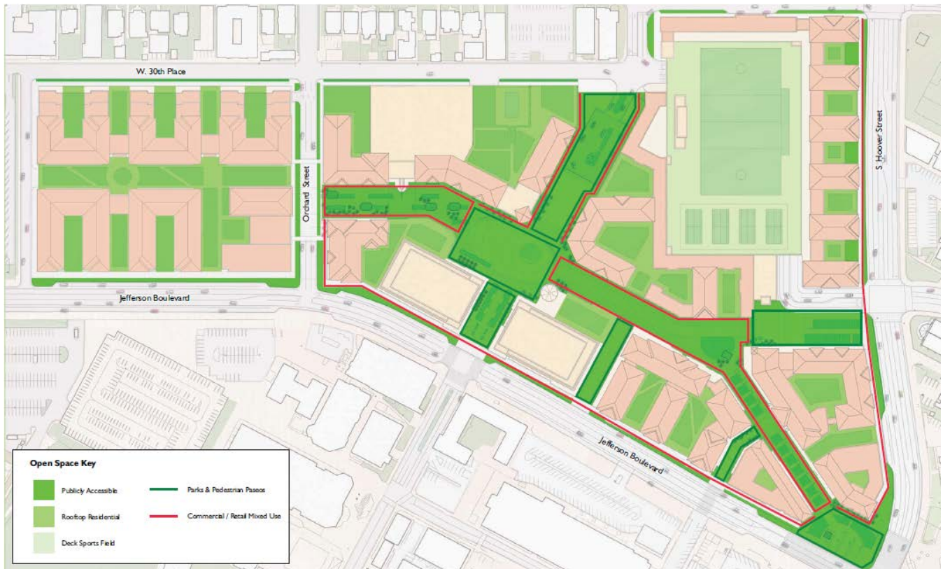
FIGURE 4. CONCEPTUAL OPEN SPACE DIAGRAM